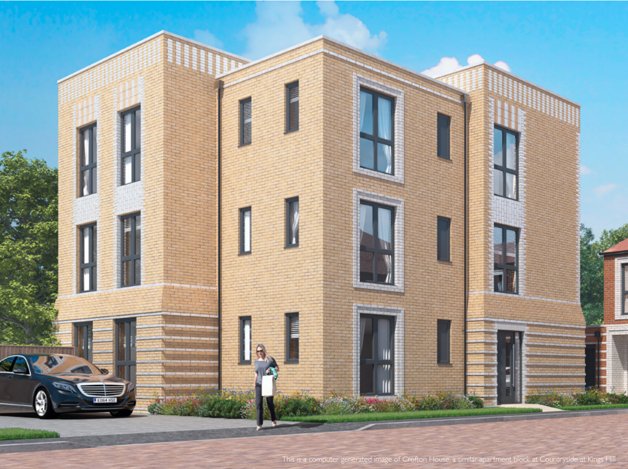
This is a computer generated image of Crofton House, a similar apartment block at Countryside at Kings Hill